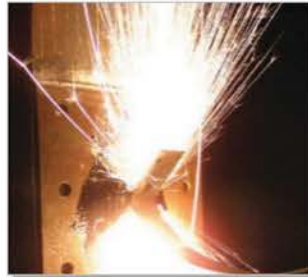
ARCING SHUNT DURING API TESTING

Substantially reducing the risk of sustained arcs requires a reliable, full-time, low impedance and low resistance bond between the tank shell and roof. Additionally, the connection must operate regardless of the tank shell's condition.