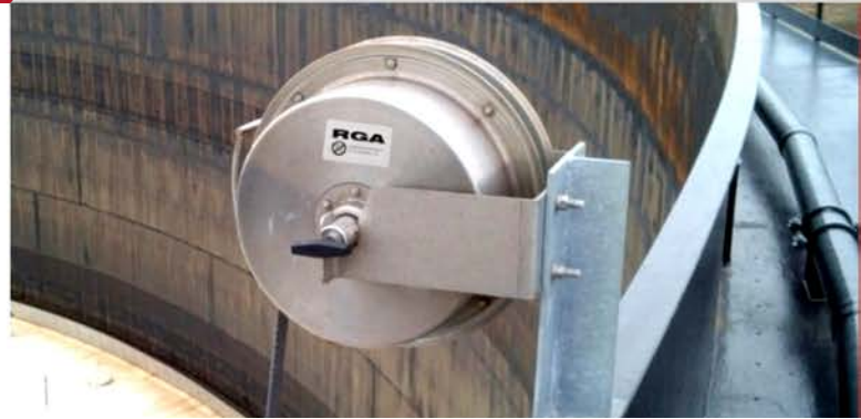
RGAR ® 750 GENERATION 2 MOUNTED TO A VERTICAL STANDOFF BRACKET* ON A FLOATING ROOF TANK.

The resultant low resistance and low impedance bond suppresses any voltage difference between the roof and shell, thus preventing ignition of flammable vapors which may be present near the floating roof seal.